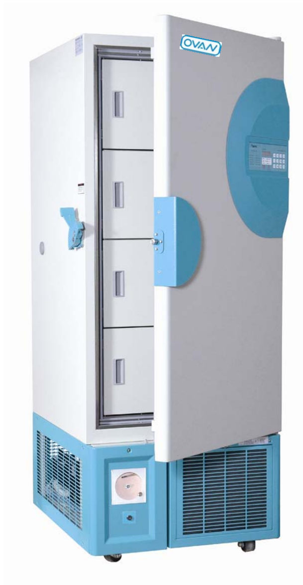
OVEVF 535/86 with optional circular chart recorder